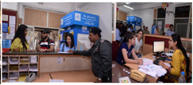
At the Bank ....Money matters