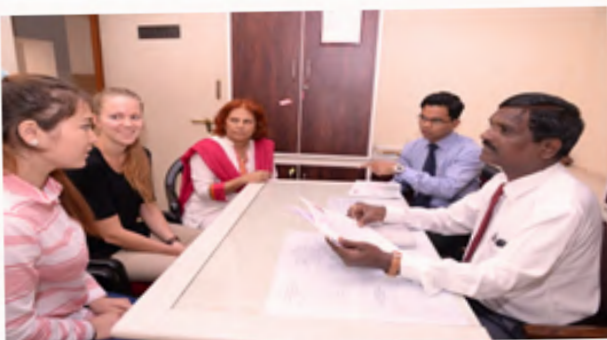
International Centre created a Special Cell with the help of FRO(Police) Government officials for International Students