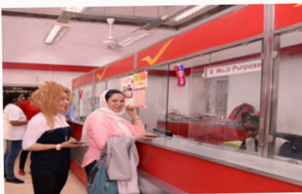
Post Office facility on campus