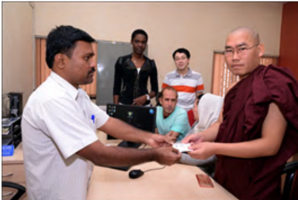
Handing over Insurance Cards to the International Students