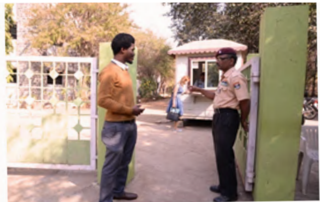
Security at the International Centre