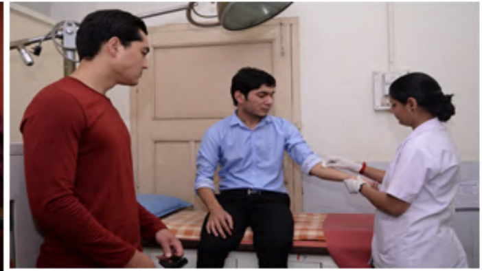
Health is wealth...at the Health Centre