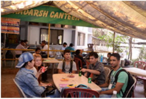
Taking a Break .....at the Canteen