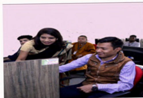
Online Exam conducted by the International Centre